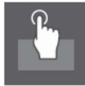
Satin Smooth Finish