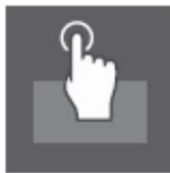
Satin Smooth Finish

Merino manufactures Matt Meister by curing the top most layer of modified acrylic with specific ray under highly controlled inert conditions. This specific ray reacts with modified acrylic layer that imparts anti finger print property to the surface.