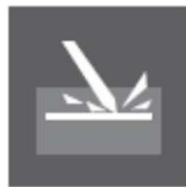
High Scratch Resistant